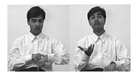
Figure 2. TIME G-WH ('when')