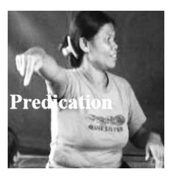
Figure 4R.3. Nominal point (reference) and locative point (predication) in Kata Kolok